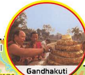
Sravasti Jetavana Vihara