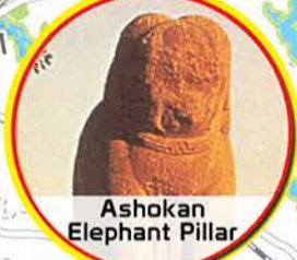
Sankisa Ashoka Elephant Pillar