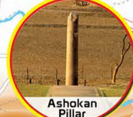
Kaushambi Ashoka Pillar