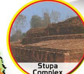
Kapilavastu Stupa Complex