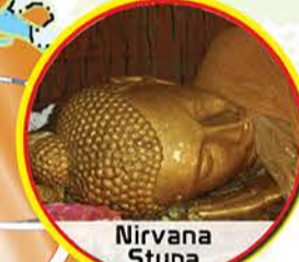
Kushinagar Nirvana Stupa